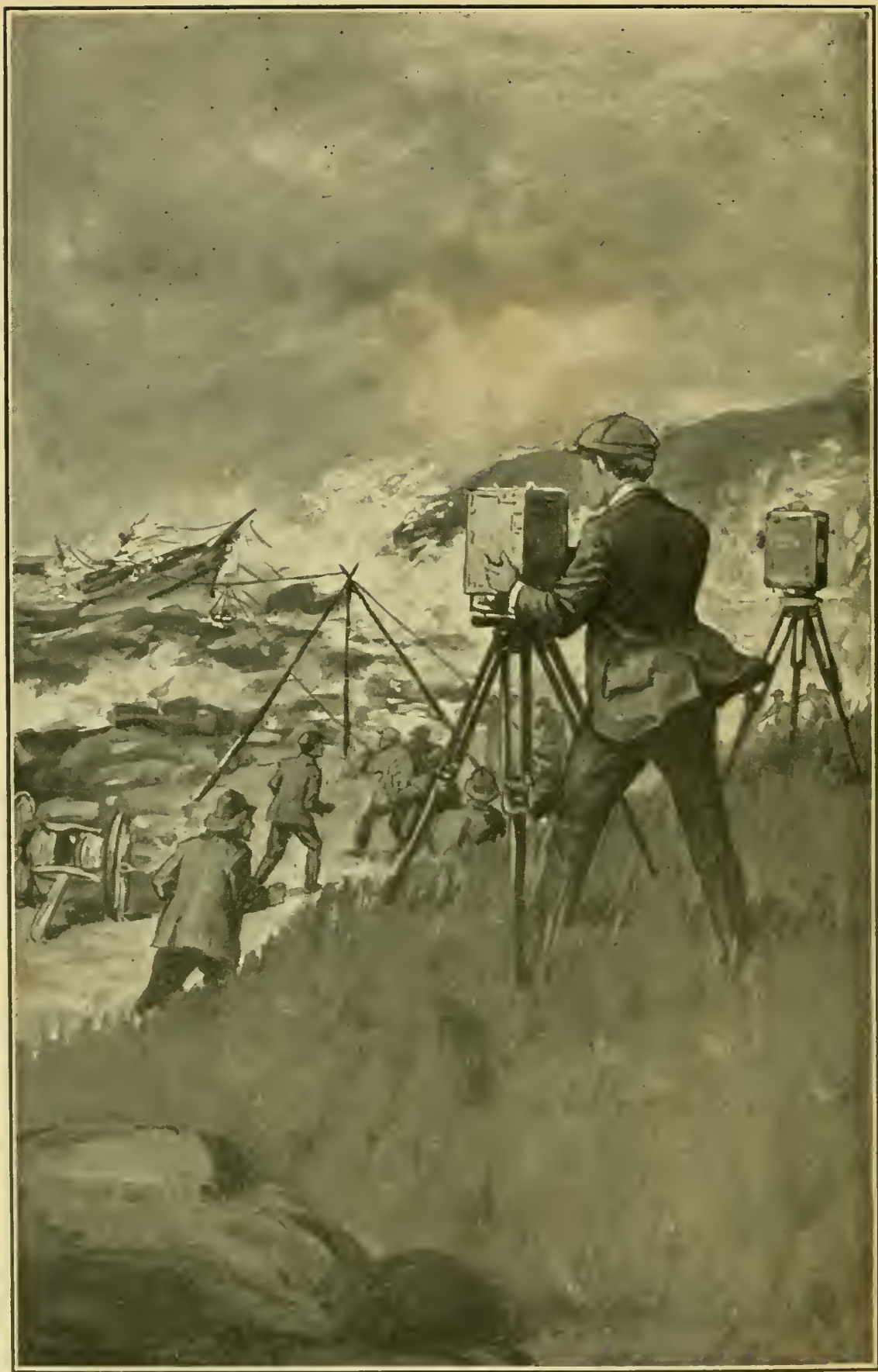
BLAKE & JOE, LEAVING THEIR AUTOMATIC CAMERA WORKING, AIDED IN THE WORK OF RESCUE.— Page 193.